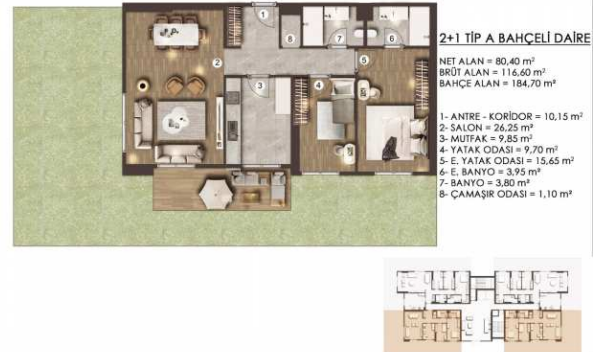
ZEMİN KAT PLANI