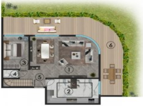
BAHÇE DUBLEKS DAİRE ALT KAT GARDEN DUPLEX APARTMENT GROUND FLOOR